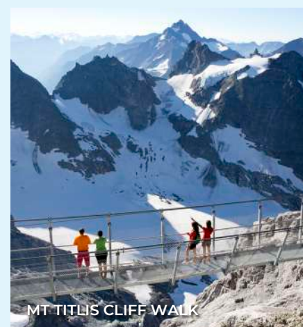
MT TITLIS CLIFF WALK

We hope you enjoyed your trip with our company and we look forward to seeing you again for your next trip.