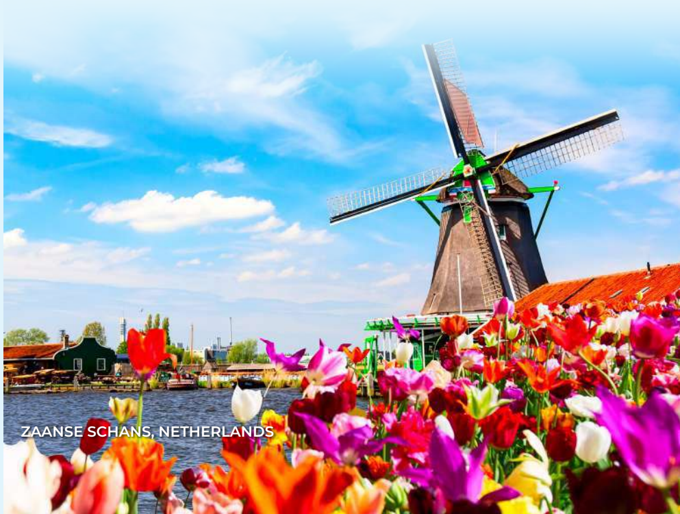
ZAANSE SCHANS, NETHERLANDS

* Note: Hotels subject to final confirmation. Should there be changes, customers will be offered similar accommodations as stated in this list.