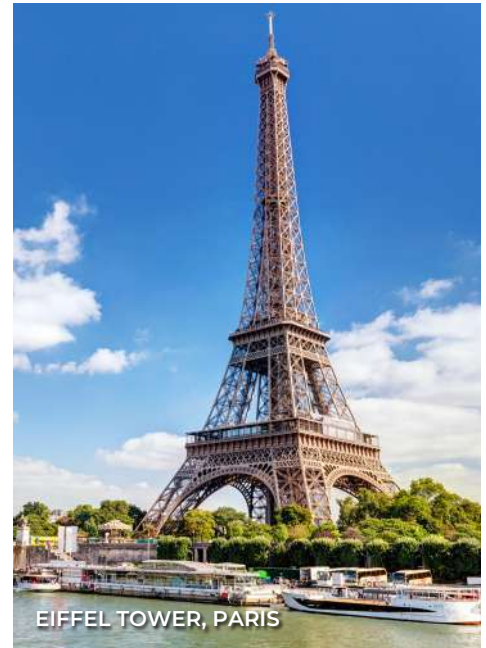
EIFFEL TOWER, PARIS

Breakfast, Western Dinner Travel to Cologne to admire the colossal Cologne Cathedral , Northern Europe's largest Gothic church, with its towering 157-meter twin spires. Head to Luxembourg, a UNESCO World Heritage Site. Cross Adolphe Bridge to the city square, featuring a blend of historic and modern architecture. Photo stop at the Monument of Remembrance , Notre-Dame Cathedral , and City Hall .