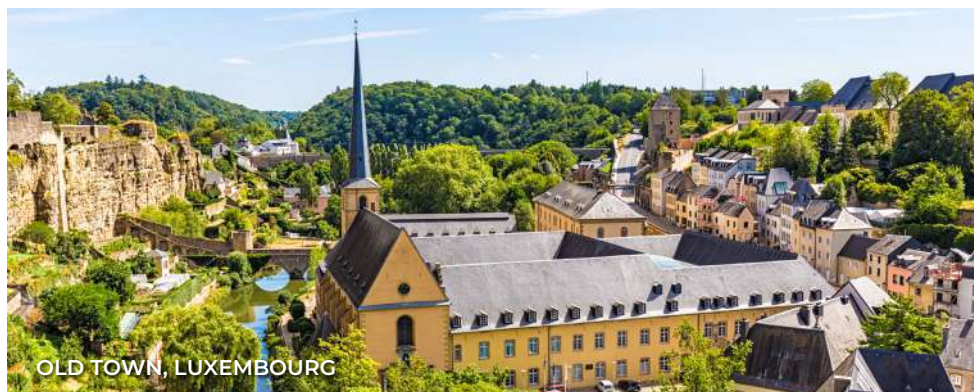
OLD TOWN, LUXEMBOURG